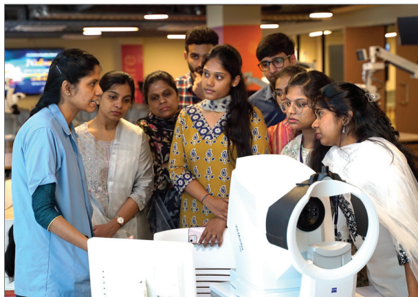
Demonstration session with the IOL Master at the CME on Dacryology Master Class

To structure the curriculum for the Postgraduate Training Programme, heads of the departments and postgraduate coordinators from over 20 colleges across Chennai shared valuable insights and suggestions to help develop a structured course aimed at enhancing postgraduate's knowledge and skills in ophthalmology.