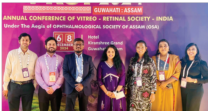
At the 33 rd Annual Conference of Vitreo Retinal Society-India (VRSI)