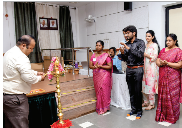
Ceremonial lamp lighting at the GenZ Symposium