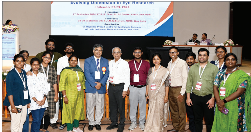
Scientists, faculty, and scholars from AMRF at the 30 th Annual Meeting of ARVO-India 2024