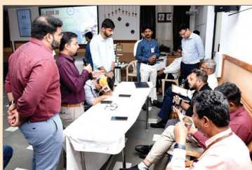
ACEi Hackathon, Aravind - Pondicherry

ACEi-Hackathon' 25 held at Aravind-Pondicherry from 3-5 January 2025, marked Aravind's sixth edition of the annual Hackathon. From 120 submitted ideas, 28 unique challenges were shortlisted. Over 48 hours of intense brainstorming and collaboration, mixed teams consisting of consultants, fellows, postgraduates, AOPs, managers, and engineering students developed and presented working prototypes addressing their selected problem statements. The most promising solutions were awarded cash prizes.