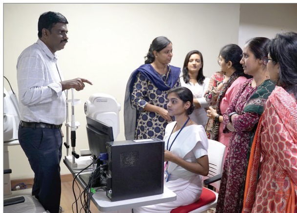
At the AKSHIVIKAS – Aravind Advanced Cataract Programme

A total of four five-day workshops between 27 th November 2024 and 23 rd March 2025 were conducted at fundamental and advanced levels for postgraduates, offering comprehensive lectures in ophthalmology, surgical training through wet and dry lab sessions, hands-on practice in ocular investigations, and live surgery observation. Postgraduate students from across India and Aravind centres participated in the