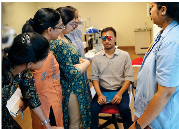
Hands-on practice for ocular investigations at the Ikshana-Comprehensive Capsule for Postgraduates