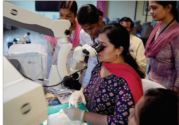
A wet lab session at the Advanced Cataract Course