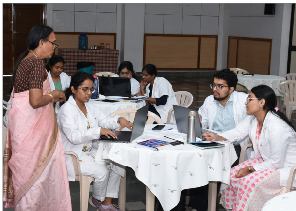
Newly joined residents learning efficient literature review techniques during the Research Methodology Workshop

dissection, complex retinal detachments, large macular holes, intraocular foreign body removal, and endophthalmitis.