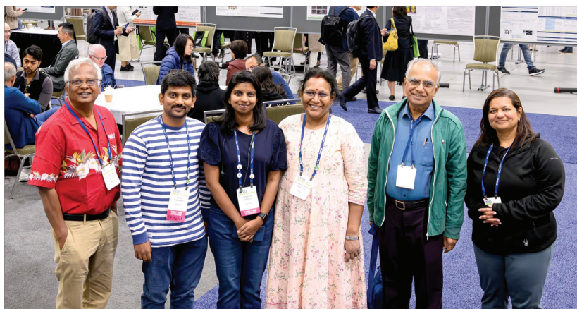
Senior scientists from AMRF at the Annual Meeting of the Association for Research in Vision and Ophthalmology (ARVO) 2024