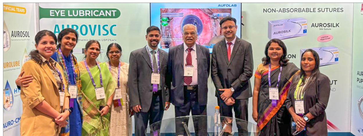
Members from Aravind at the Annual Meeting of American Academy of Ophthalmology