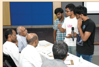
Hackathon, Aravind - Tirupati

Two Hackathon events were successfully organised last year under the banner of the Aravind Centre for Eyecare Innovation (ACEi). The first mid year hackathon - the Eye Innovation Hackathon 2024, was jointly conducted by ACEi and IIT Tirupati at Aravind-Tirupati on 23-24 August 2024. Around 70 participants, including students from IIT Tirupati, Aravind doctors, and technicians, collaborated on nine problem statements, each aimed at finding innovative solutions in eye care.