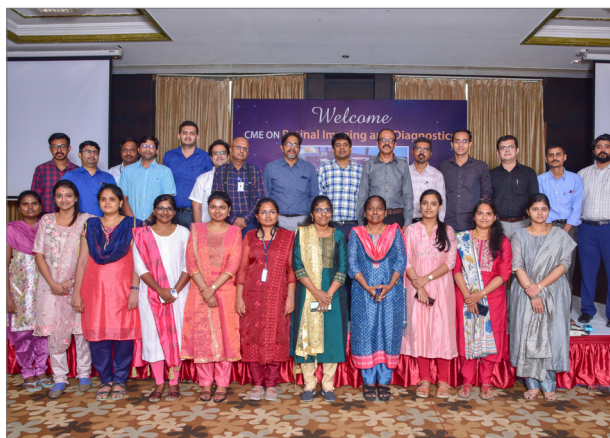
Participants of the CME on Retinal Imaging and Diagnostics

The CME programme covering all aspects of paediatric ophthalmology, featured 12 talks, two case