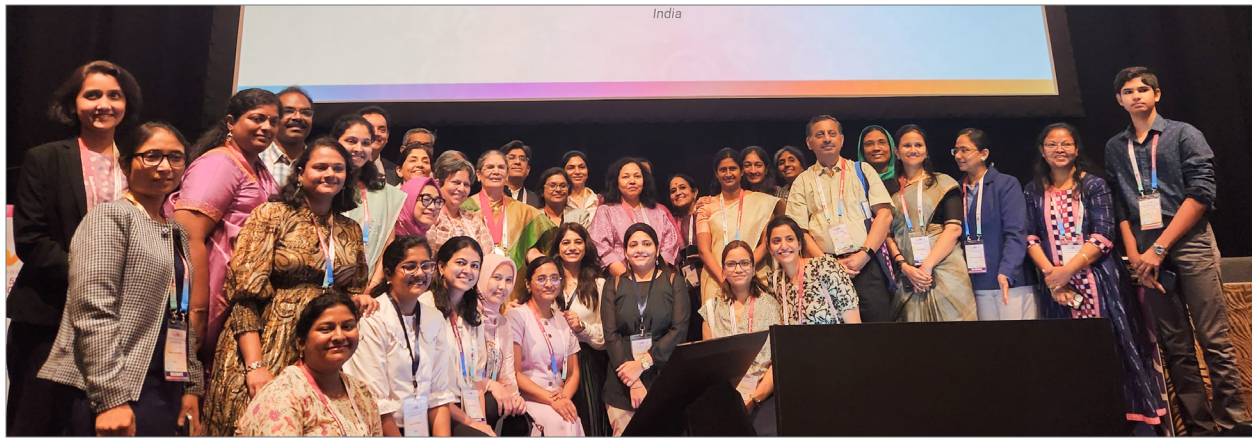
Doctors from Aravind at the 5 th World Congress of Paediatric Ophthalmology & Strabismus, Kuala Lumpur