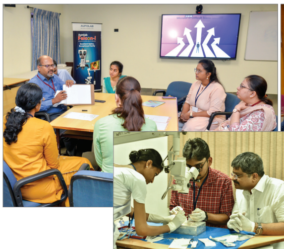
At the surgical CME - AT Tension