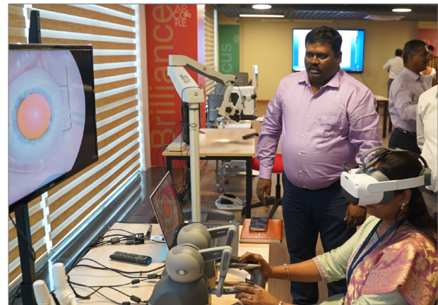
Training on the VR Simulator during the Short-Term Postgraduate Training Programme

Held in collaboration with AIOS and TNOA, this postgraduate update programme provided a comprehensive overview of glaucoma, featuring hands-on training in various procedures such as applanation tonometry and gonioscopy.