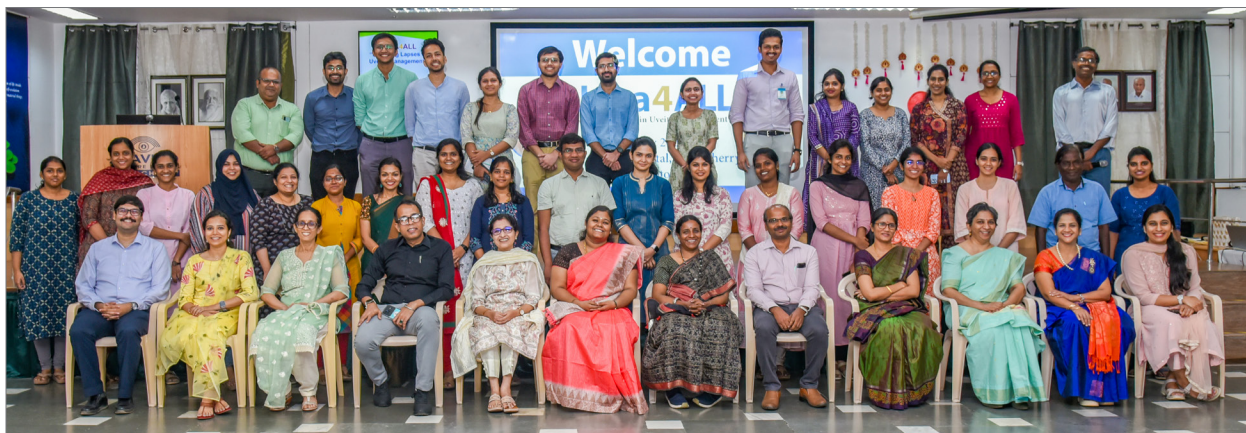
Participants of the CME on Uvea4all

With participation from over 200 residents from across the country, the three-day programme featured 50 insightful lectures by both internal and external faculty, covering all essential topics in ophthalmology. In addition, hands-on workshops, interactive sessions, and six dry lab sessions were conducted.