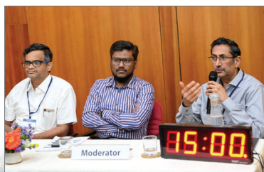
Participants of the Retina Surgical Mélange 2025

Focusing on extending the boundaries of glaucoma management and surgical excellence, the conclave comprised talks by renowned faculty, case-based discussions, wet lab, and video assisted skill transfer, covering all the aspects of secondary glaucoma.