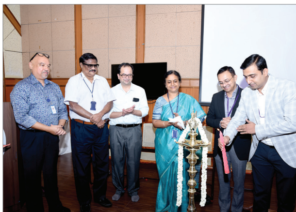
Ceremonial lamp lighting at the AIOS ARC Postgraduate Refresher Programme