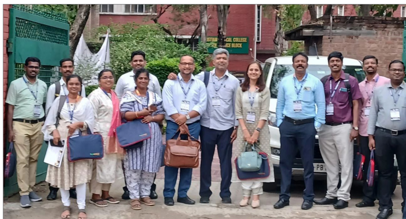
Aravind staff members at the 18th edition of Vision 2020: The Right to Sight-INDIA