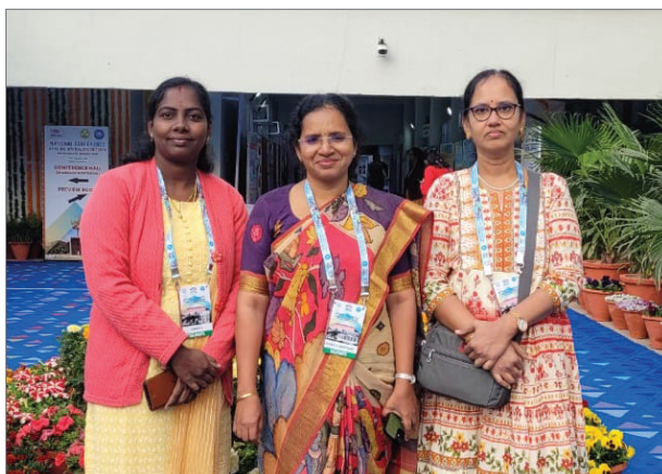
Aravind doctors at the National Conference of NCNO 2025